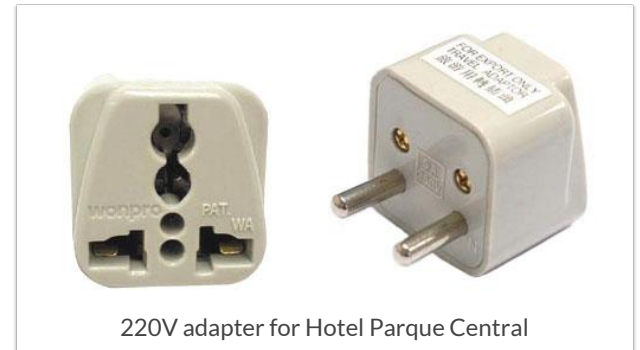
220V adapter for Hotel Parque Central

Laundry – There are no Laundromats in Cuba; however, most hotels offer a laundry service and charge on a per piece basis.